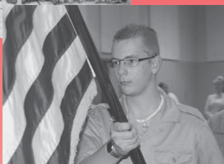
“The Lines Project”