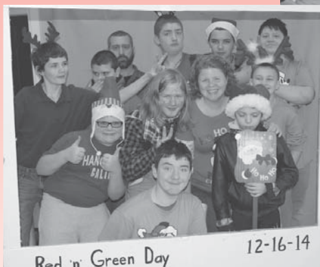
Red 'n' Green Day